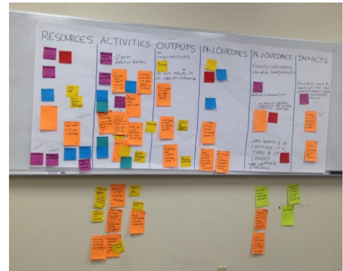
What our work looked like at the end of the day